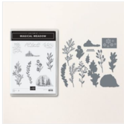
Magical Meadow Bundle (English) - 162144