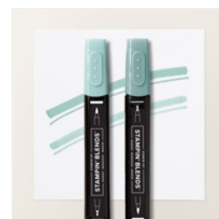
Lost Lagoon Stampin' Blends Combo Pack - 161680