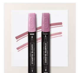
Moody Mauve Stampin' Blends Combo Pack - 161660