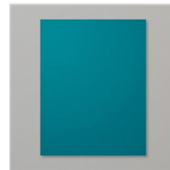
Pretty Peacock 8-1/2" X 11" Cardstock - 150880