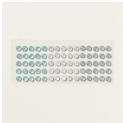
Faceted Gems Trio Pack - 162148