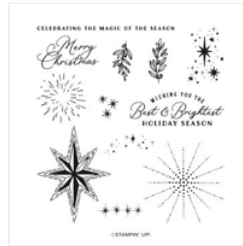
Stars At Night Photopolymer Stamp Set (English) - 162000