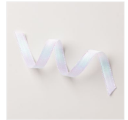
White 1/2" (1.3 Cm) Iridescent Ribbon - 161955