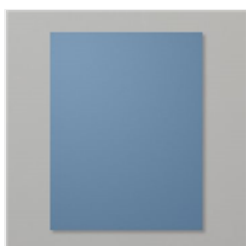
Misty Moonlight 8-1/2" X 11" Cardstock - 153081