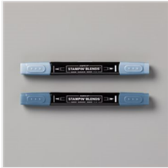
Misty Moonlight Stampin' Blends Combo Pack - 153108

inkybeestampers@gmail.com https://www.inkybeestampers.com