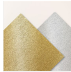
Silver & Gold 12" X 12" (30.5 X 30.5 Cm) Adhesive- Backed Glimmer Paper - 162288