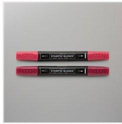
Cherry Cobbler Stampin' Blends Combo Pack - 154880