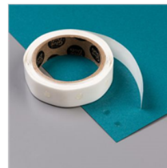
Mini Glue Dots - 103683