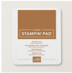
Pecan Pie Classic Stampin' Pad - 161665