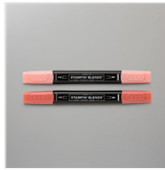
Calypso Coral Stampin' Blends Combo Pack - 154881