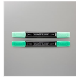
Shaded Spruce Stampin' Blends Combo Pack - 154903