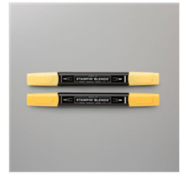
Daffodil Delight Stampin' Blends Combo Pack - 154883