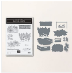
Rustic Crate Bundle (English) - 162268