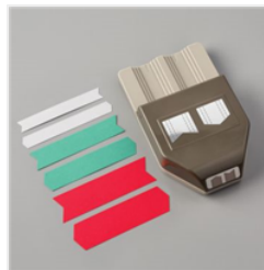
Banners Pick A Punch - 153608