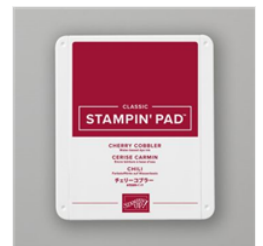
Cherry Cobbler Classic Stampin' Pad - 147083