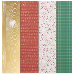
Joyful 12" X 12" (30.5 X 30.5 Cm) Specialty Designer Series Paper - 161980