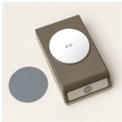
2-3/8" (6 Cm) Circle Punch - 161354