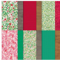
Joy Of Christmas 12" X 12" (30.5 X 30.5 Cm) Designer Series Paper - 161958