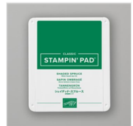
Shaded Spruce Classic Stampin' Pad - 147088