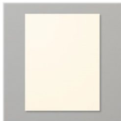
Very Vanilla 8-1/2" X 11" Cardstock - 101650