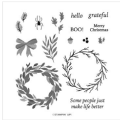
Cottage Wreaths Photopolymer Stamp Set (English) - 159652