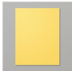
Daffodil Delight 8- 1/2" X 11" Cardstock - 119683