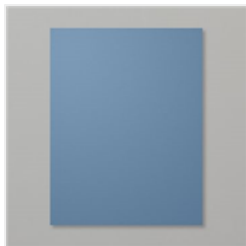
Misty Moonlight 8- 1/2" X 11" Cardstock - 153081