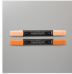
Pumpkin Pie Stampin' Blends Combo Pack - 154897