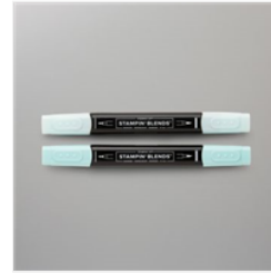
Pool Party Stampin' Blends Combo Pack - 154894