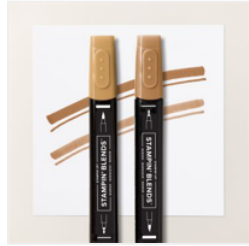
Pecan Pie Stampin' Blends Combo Pack - 161674