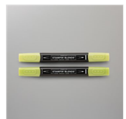
Granny Apple Green Stampin' Blends Combo Pack - 154885