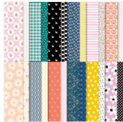
Delightfully Eclectic 12" X 12" (30.5 X 30.5 Cm) Designer Series Paper - 161640