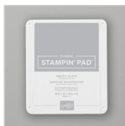
Smoky Slate Classic Stampin' Pad - 147113