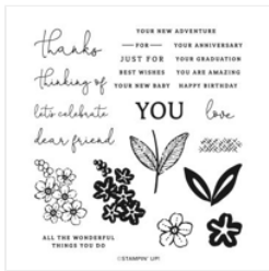
Sentimental Park Photopolymer Stamp Set (English) - 160561