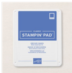
Orchid Oasis Classic Stampin' Pad - 159214