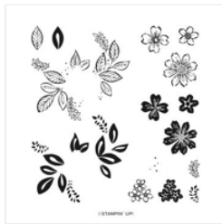
Petal Park Photopolymer Stamp Set - 160571