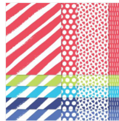
2022-2024 In Color 6" X 6" (15.2 X 15.2 Cm) Designer Series Paper - 161645