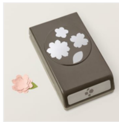
Petal Park Builder Punch - 160576