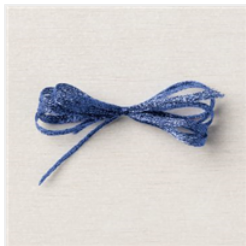
Orchid Oasis 1/8" (3.2 Mm) Woven Metallic Ribbon - 159199