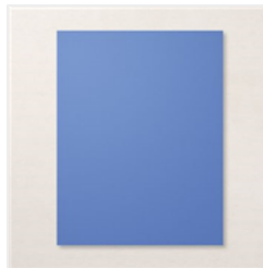
Orchid Oasis 8- 1/2" X 11" Cardstock - 159267