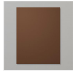
Early Espresso 8- 1/2" X 11" Cardstock - 119686