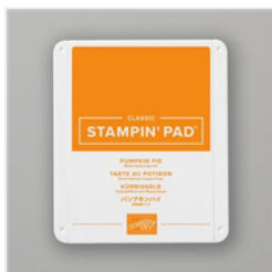
Pumpkin Pie Classic Stampin' Pad - 147086