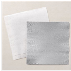
Timber 3D Embossing Folder - 156406