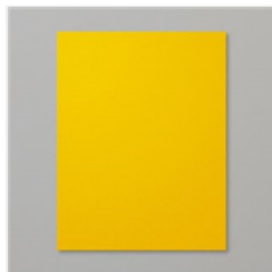
Crushed Curry 8- 1/2" X 11" Cardstock - 131199