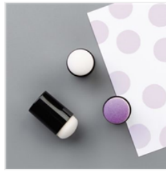
Sponge Daubers - 133773