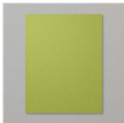
Old Olive 8-1/2" X 11" Cardstock - 100702