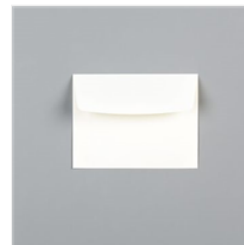
Very Vanilla Medium Envelopes - 107300