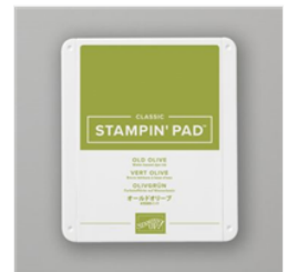
Old Olive Classic Stampin' Pad - 147090