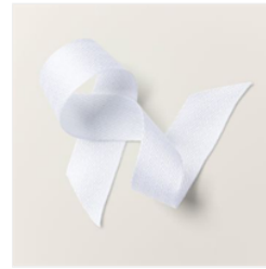
3/4" (1.9 Cm) Herringbone Ribbon - 161636