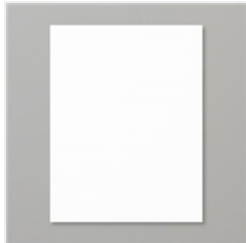
Basic White 8-1/2" X 11" Cardstock - 159276