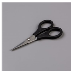
Paper Snips Scissors - 103579