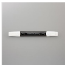
Stampin' Blends Color Lifter - 144608