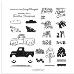
Trucking Along Photopolymer Stamp Set (English) - 162299