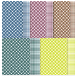
Glorious Gingham 6" X 6" (15.2 X 15.2 Cm) Designer Series Paper - 163170