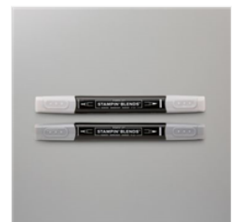
Smoky Slate Stampin' Blends Combo Pack - 154904