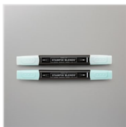
Pool Party Stampin' Blends Combo Pack - 154894