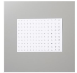
Rhinestone Basic Jewels - 144220