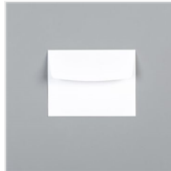
Basic White Medium Envelopes - 159236