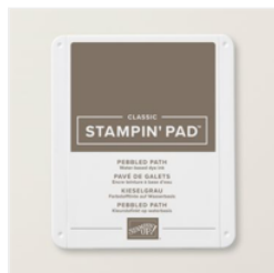
Pebbled Path Classic Stampin' Pad - 161648