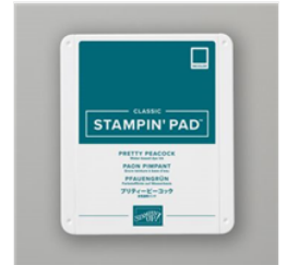
Pretty Peacock Classic Stampin' Pad - 150083