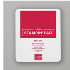
Real Red Classic Stampin' Pad - 147084