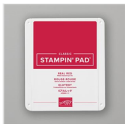
Real Red Classic Stampin' Pad - 147084