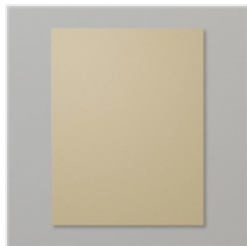
Crumb Cake 8-1/2" X 11" Cardstock - 120953