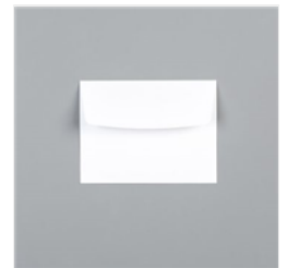
Basic White Medium Envelopes - 159236