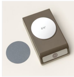
2-3/8" (6 Cm) Circle Punch - 161354