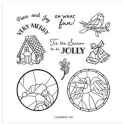
So Very Merry Photopolymer Stamp Set (English) - 162345

inkybeestampers@gmail.com https://www.inkybeestampers.com