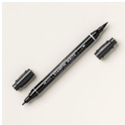
Basic Black Stampin' Write Marker - 162481