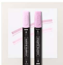
Bubble Bath Stampin' Blends Combo Pack - 161675