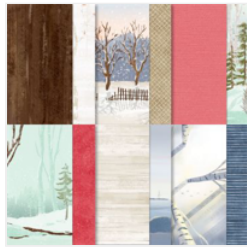
One Horse Open Sleigh 6" X 6" (15.2 X 15.2 Cm) Designer Series Paper - 162118