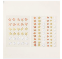
Adhesive-Backed Snowflake Assortment - 162129