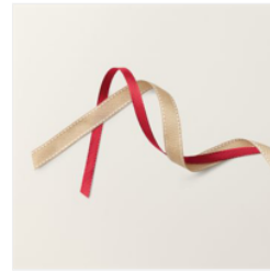
Real Red & Burlap Ribbon Combo Pack - 160386