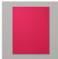
Real Red 8-1/2" X 11" Cardstock - 102482