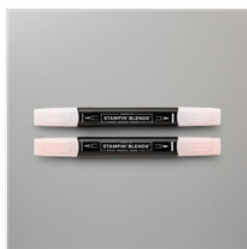
Petal Pink Stampin' Blends Combo Pack - 154893