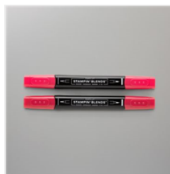
Real Red Stampin' Blends Combo Pack - 154899