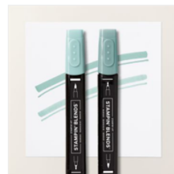
Lost Lagoon Stampin' Blends Combo Pack - 161680