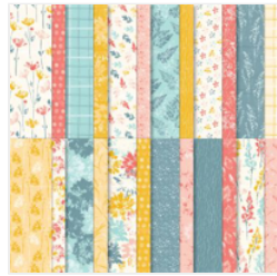
Inked Botanicals 6" X 6" (15.2 X 15.2 Cm) Designer Series Paper - 161157