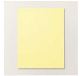
Lemon Lolly 8-1/2" X 11" Cardstock - 161720