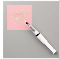
Wink Of Stella Clear Glitter Brush - 141897