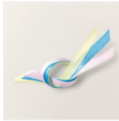
3/8" (1 Cm) Sheer Ribbon Combo Pack - 161635