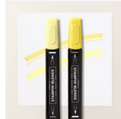
Lemon Lolly Stampin' Blends Combo Pack - 161673