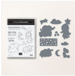
Little Dreamers Bundle (English) - 161579