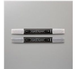
Smoky Slate Stampin' Blends Combo Pack - 154904