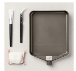
Embossing Additions Tool Kit - 159971