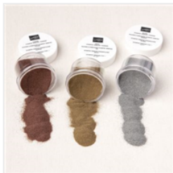
Metallics Embossing Powders - 155555