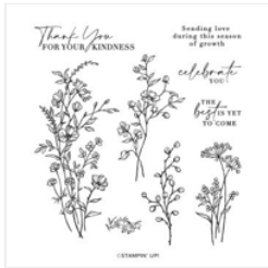
Dainty Delight Cling Stamp Set (English) - 161078