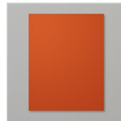
Cajun Craze 8-1/2" X 11" Cardstock - 119684