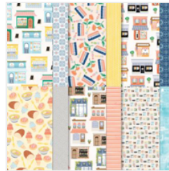
Les Shoppes 12" X 12" (30.5 X 30.5 Cm) Designer Series Paper - 161322