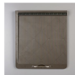
Simply Scored Scoring Tool - 122334