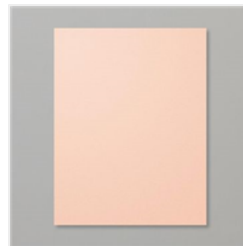
Petal Pink 8-1/2" X 11" Cardstock - 146985