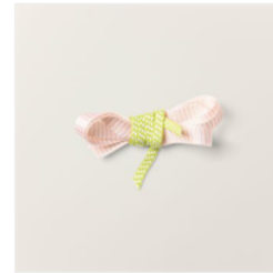
Ribbon Duo Combo Pack - 161318