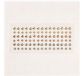
Brushed Metallic Adhesive Backed Dots - 156506