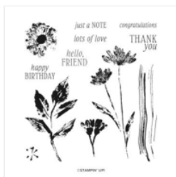
Inked & Tiled Cling Stamp Set (English) - 161158