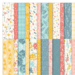
Inked Botanicals 6" X 6" (15.2 X 15.2 Cm) Designer Series Paper - 161157