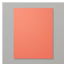
Calypso Coral 8-1/2" X 11" Cardstock - 122925