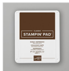
Early Espresso Classic Stampin' Pad - 147114