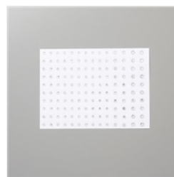
Rhinestone Basic Jewels - 144220