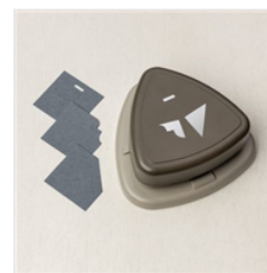
Very Best Trio Punch - 159878