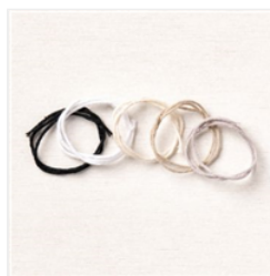
Baker's Twine Essentials Pack - 155475