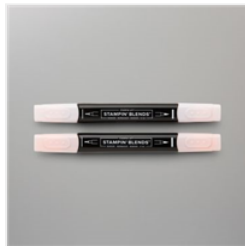
Petal Pink Stampin' Blends Combo Pack - 154893