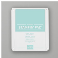
Pool Party Classic Stampin' Pad - 147107