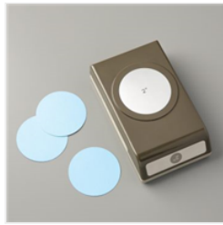
2" (5.1 Cm) Circle Punch - 133782