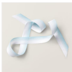
Balmy Blue/White 1/2" (1.3 Cm) Variegated Ribbon - 160448