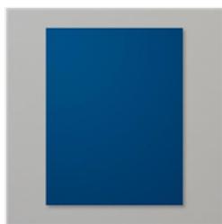
Night Of Navy 8- 1/2" X 11" Cardstock - 100867