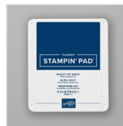
Night Of Navy Classic Stampin' Pad - 147110