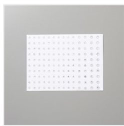
Rhinestone Basic Jewels - 144220