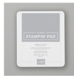
Smoky Slate Classic Stampin' Pad - 147113