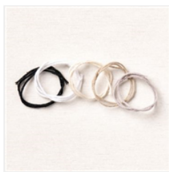
Baker's Twine Essentials Pack - 155475