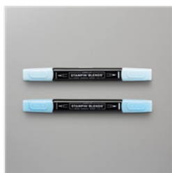
Balmy Blue Stampin' Blends Combo Pack - 154830