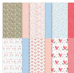
Country Floral Lane 12" X 12" (30.5 X 30.5 Cm) Designer Series Paper - 160375