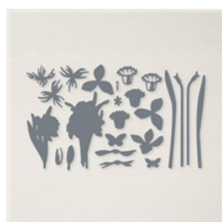
Daffodil Dies - 157794