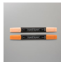
Pumpkin Pie Stampin' Blends Combo Pack - 154897