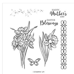
Daffodil Daydream Cling Stamp Set (English) - 157786