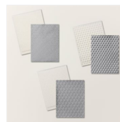
Basics 3D Embossing Folders - 161598