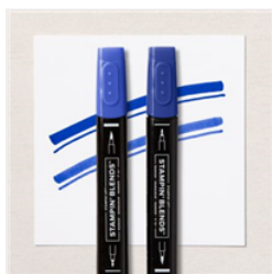
Starry Sky Stampin' Blends Combo Pack - 159222