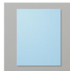
Balmy Blue 8-1/2" X 11" Cardstock - 146982