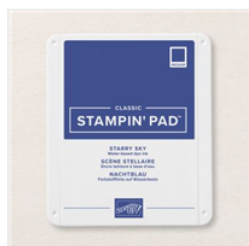
Starry Sky Classic Stampin' Pad - 159212