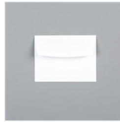
Basic White Medium Envelopes - 159236