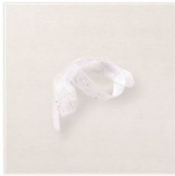
White 3/8" (1 Cm) Glittered Organdy Ribbon - 156408