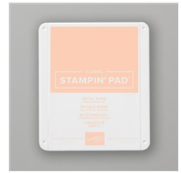
Petal Pink Classic Stampin' Pad - 147108