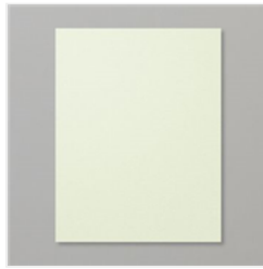
Soft Sea Foam 8- 1/2" X 11" Cardstock - 146988