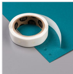
Mini Glue Dots - 103683