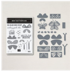
Best Butterflies Bundle (English) - 159120