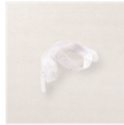
White 3/8" (1 Cm) Glittered Organdy Ribbon - 156408