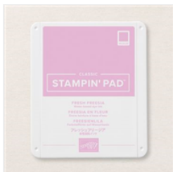
Fresh Freesia Classic Stampin' Pad - 155611