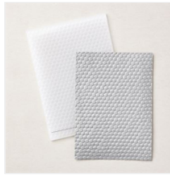
Hive 3D Embossing Folder - 164424