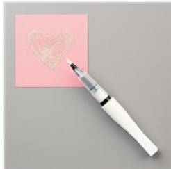
Wink Of Stella Clear Glitter Brush - 141897