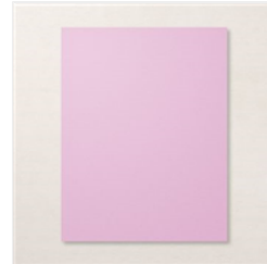
Fresh Freesia 8- 1/2" X 11" Cardstock - 155613