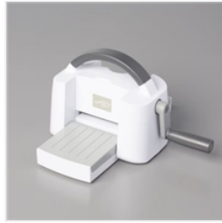
Mini Stampin' Cut & Emboss Machine - 150673