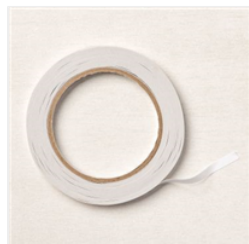
Tear & Tape Adhesive - 154031