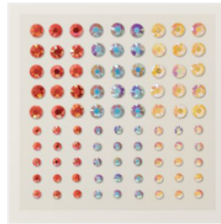
Iridescent Pastel Gems - 160429