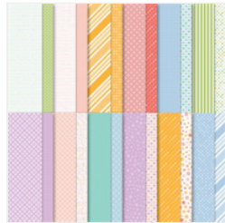
Dandy Designs 12" X 12" (30.5 X 30.5 Cm) Designer Series Paper - 160836