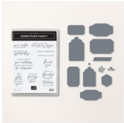
Something Fancy Bundle (English) - 160425