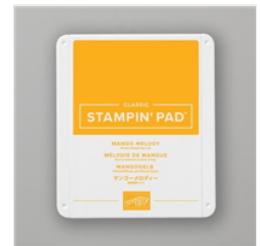
Mango Melody Classic Stampin' Pad - 147093