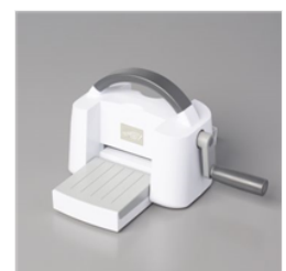
Mini Stampin' Cut & Emboss Machine - 150673