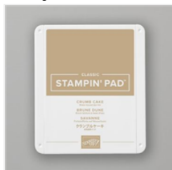
Crumb Cake Classic Stampin' Pad - 147116

inkybeestampers@gmail.com https://www.inkybeestampers.com