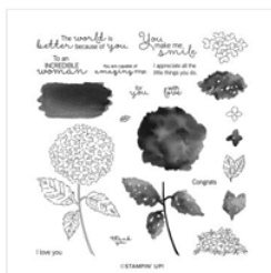
Hydrangea Haven Photopolymer Stamp Set - 158210