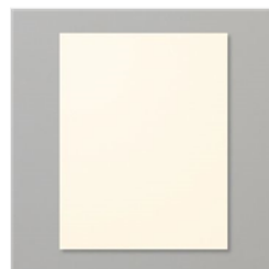
Very Vanilla 8-1/2" X 11" Cardstock - 101650