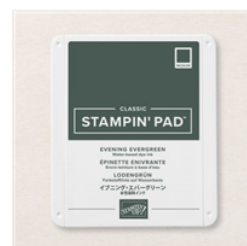
Evening Evergreen Classic Stampin' Pad - 155576