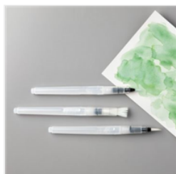
Water Painters - 151298