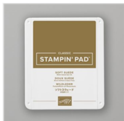
Soft Suede Classic Stampin' Pad - 147115