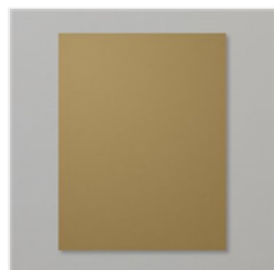
Soft Suede 8-1/2" X 11" Cardstock - 115318