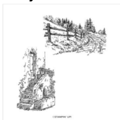
In The Country Cling Stamp Set - 160828

inkybeestampers@gmail.com https://www.inkybeestampers.com