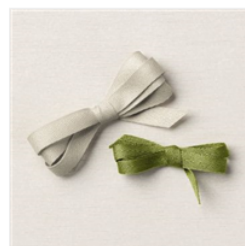
Old Olive & Sahara Sand Twill Ribbon Combo Pack - 158955