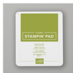
Old Olive Classic Stampin' Pad - 147090