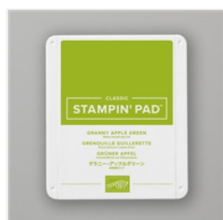
Granny Apple Green Classic Stampin' Pad - 147095