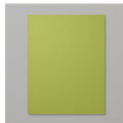
Old Olive 8-1/2" X 11" Cardstock - 100702