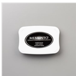
Tuxedo Black Memento Ink Pad - 132708