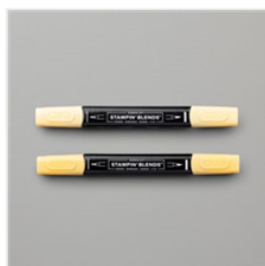
So Saffron Stampin' Blends Combo Pack - 154905