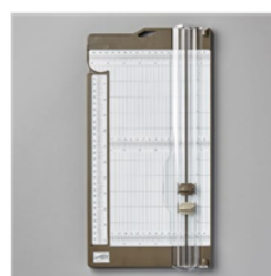
Paper Trimmer - 152392