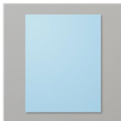
Balmy Blue 8-1/2" X 11" Cardstock - 146982