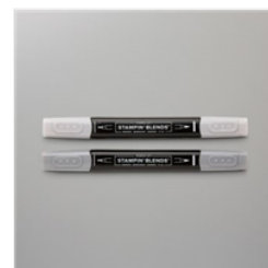
Smoky Slate Stampin' Blends Combo Pack - 154904