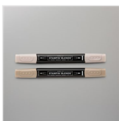
Crumb Cake Stampin' Blends Combo Pack - 154882