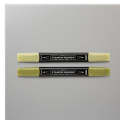
Old Olive Stampin' Blends Combo Pack - 154892