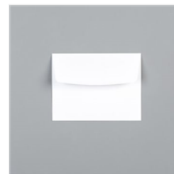
Basic White Medium Envelopes - 159236