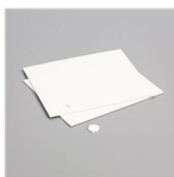
Stampin' Dimensionals - 104430