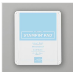
Balmy Blue Classic Stampin' Pad - 147105