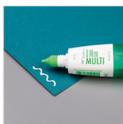
Multipurpose Liquid Glue - 110755