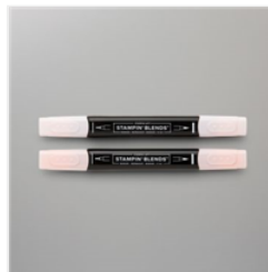
Petal Pink Stampin' Blends Combo Pack - 154893