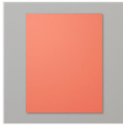
Calypso Coral 8-1/2" X 11" Cardstock - 122925