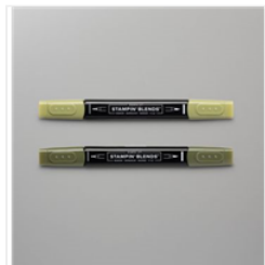
Mossy Meadow Stampin' Blends Combo Pack - 154890