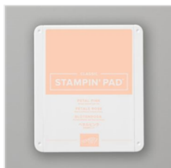
Petal Pink Classic Stampin' Pad - 147108