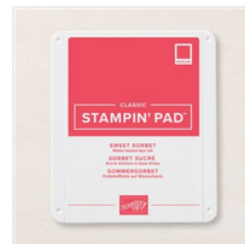
Sweet Sorbet Classic Stampin' Pad - 159216