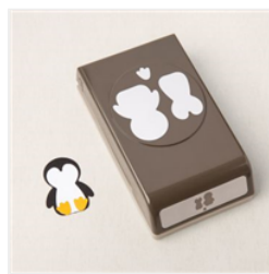
Penguin Builder Punch - 156452