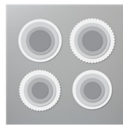
Layering Circles Dies - 151770