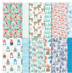
Storybook Gnomes 12" X 12" (30.5 X 30.5 Cm) Designer Series Paper - 159615