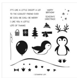
Penguin Place Photopolymer Stamp Set (English) - 156410