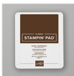
Early Espresso Classic Stampin' Pad - 147114