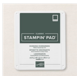
Evening Evergreen Classic Stampin' Pad - 155576