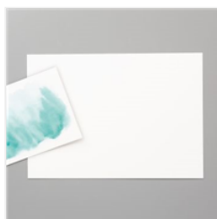
Fluid 100 Watercolor Paper - 149612