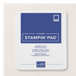
Starry Sky Classic Stampin' Pad - 159212