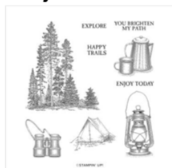
Campology Cling Stamp Set - 152553