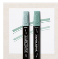
Soft Succulent Stampin' Blends Combo Pack - 155521