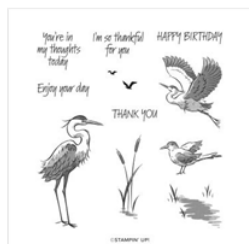
Heron Habitat Cling Stamp Set (English) - 158889