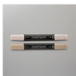
Crumb Cake Stampin' Blends Combo Pack - 154882