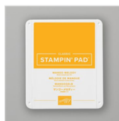
Mango Melody Classic Stampin' Pad - 147093