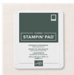
Evening Evergreen Classic Stampin' Pad - 155576