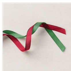
Real Red & Garden Green 3/8" (1 Cm) Ribbon Combo Pack - 159577