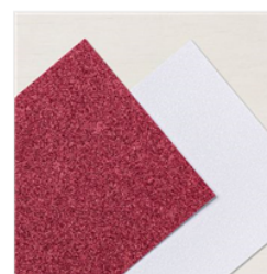
Real Red & White 6" X 6" (15.2 X 15.2 Cm) Glimmer Paper - 159578