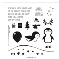
Penguin Place Photopolymer Stamp Set (English) - 156410