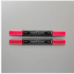
Real Red Stampin' Blends Combo Pack - 154899