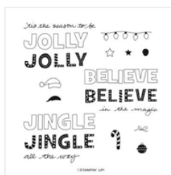
Jingle Jingle Jingle Photopolymer Stamp Set (English) - 153438