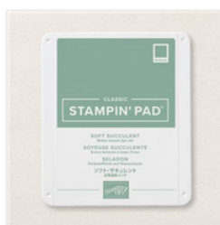
Soft Succulent Classic Stampin' Pad - 155778