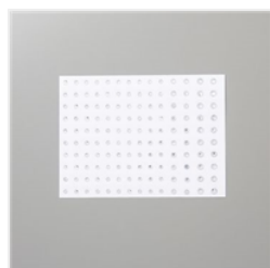
Rhinestone Basic Jewels - 144220