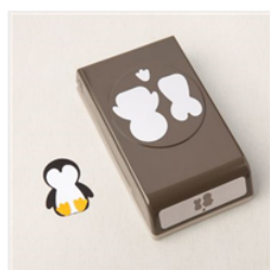
Penguin Builder Punch - 156452