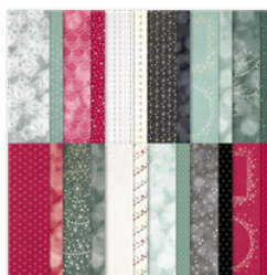
Lights Aglow 6" X 6" (15.2 X 15.2 Cm) Specialty Designer Series Paper - 159535