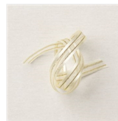
Gold & Vanilla 3/8" (1 Cm) Satin Edged Ribbon - 159555