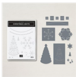
Christmas Lights Bundle (English) - 159961