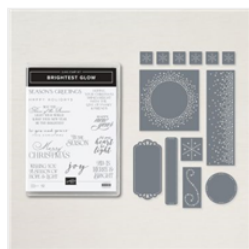
Brightest Glow Bundle (English) - 159552