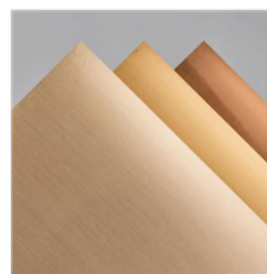
Brushed Metallic Cardstock - 153524