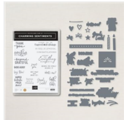
Charming Sentiments Bundle (English) - 158734