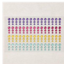
Glossy Dots Assortment - 158827