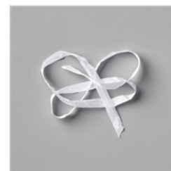
Whisper White 1/4" (6.4 Mm) Crinkled Seam Binding Ribbon - 151326