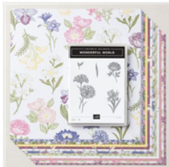
Wonderful World Bundle (English) - 159918