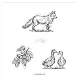
Stylish Sketches Cling Stamp Set - 159937