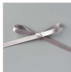
Gray Granite 1/4" (6.4 Mm) Shimmer Ribbon - 152463