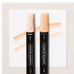
Pale Papaya Stampin' Blends Combo Pack - 155519