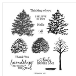
Beauty Of Friendship Photopolymer Stamp Set - 154983