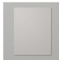
Gray Granite 8- 1/2" X 11" Cardstock - 146983