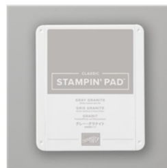
Gray Granite Classic Stampin' Pad - 147118