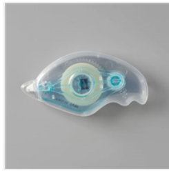
Stampin' Seal - 152813