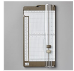
Paper Trimmer - 152392