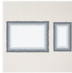
Deckled Rectangles Dies - 159173