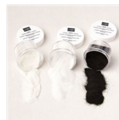
Basics Embossing Powders - 155554