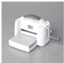
Stampin' Cut & Emboss Machine - 149653