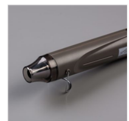
Heat Tool - 129053