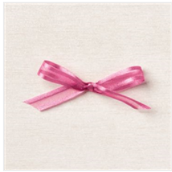
Polished Pink 3/8" (1 Cm) Open Weave Ribbon - 155714