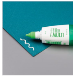
Multipurpose Liquid Glue - 110755