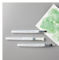
Water Painters - 151298