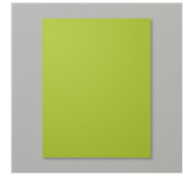
Granny Apple Green 8-1/2" X 11" Cardstock - 146990