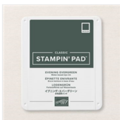
Evening Evergreen Classic Stampin' Pad - 155576