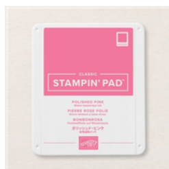
Polished Pink Classic Stampin' Pad - 155712