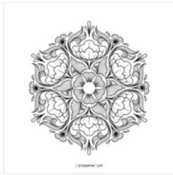
Pretty Medallion Cling Stamp Set - 158930