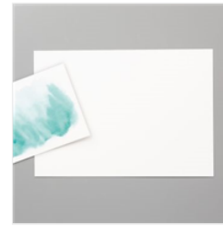
Fluid 100 Watercolor Paper - 149612