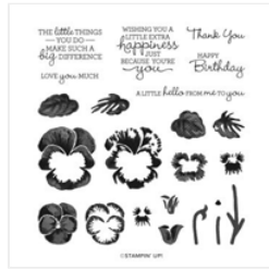
Pansy Patch Photopolymer Stamp Set (English) - 154999