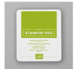
Granny Apple Green Classic Stampin' Pad - 147095