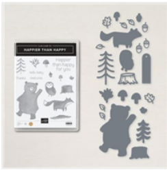
Happier Than Happy Bundle (English) - 158952