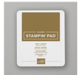
Soft Suede Classic Stampin' Pad - 147115