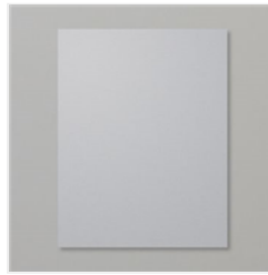
Smoky Slate 8-1/2" X 11" Cardstock - 131202