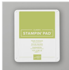
Pear Pizzazz Classic Stampin' Pad - 147104