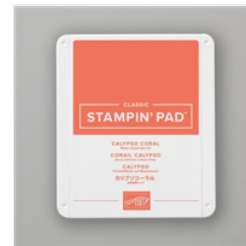
Calypso Coral Classic Stampin' Pad - 147101