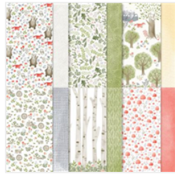
Happy Forest Friends 12" X 12" (30.5 X 30.5 Cm) Designer Series Paper - 158941