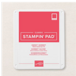
Sweet Sorbet Classic Stampin' Pad - 159216