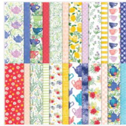
Tea Boutique 6" X 6" (15.2 X 15.2 Cm) Designer Series Paper - 158659