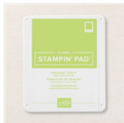
Parakeet Party Classic Stampin' Pad - 159208