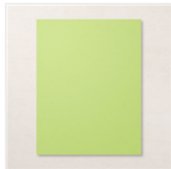
Parakeet Party 8- 1/2" X 11" Cardstock - 159259