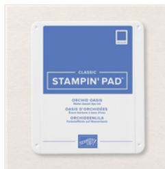
Orchid Oasis Classic Stampin' Pad - 159214