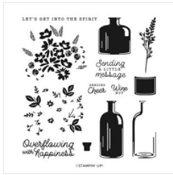
Bottled Happiness Photopolymer Stamp Set (English) - 158684