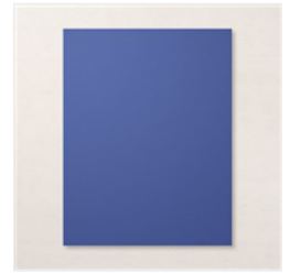
Starry Sky 8-1/2" X 11" Cardstock - 159263