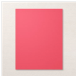
Sweet Sorbet 8- 1/2" X 11" Cardstock - 159268