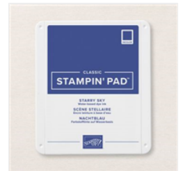
Starry Sky Classic Stampin' Pad - 159212