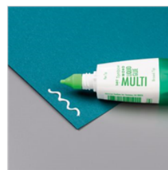
Multipurpose Liquid Glue - 110755