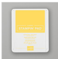
Daffodil Delight Classic Stampin' Pad - 147094