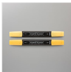
Daffodil Delight Stampin' Blends Combo Pack - 154883