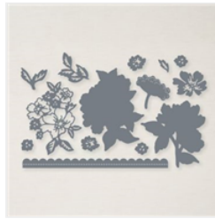
Penned Flowers Dies - 155557