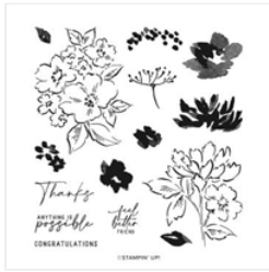
Hand-Penned Petals Photopolymer Stamp Set - 155070