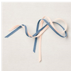
1/8" (3.2 Mm) Cotton Ribbon Combo Pack - 158140