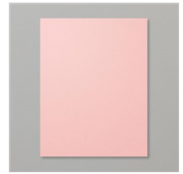
Blushing Bride 8- 1/2" X 11" Cardstock - 131198