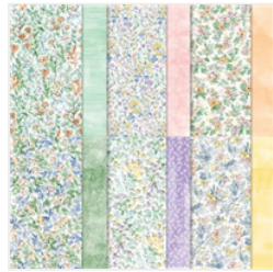
Hand-Penned 12" X 12" (30.5 X 30.5 Cm) Designer Series Paper - 155499