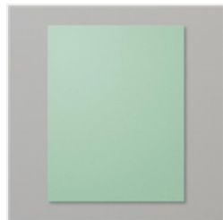
Mint Macaron 8- 1/2" X 11" Cardstock - 138337