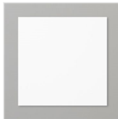
Basic White 12X12 (30.5 X 30.5 Cm) Cardstock - 159231