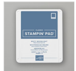
Misty Moonlight Classic Stampin' Pad - 153118