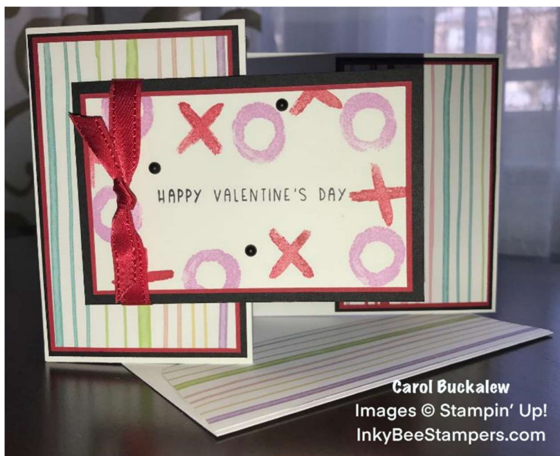
Carol Buckalew Images © Stampin' Up! InkyBeeStampers.com